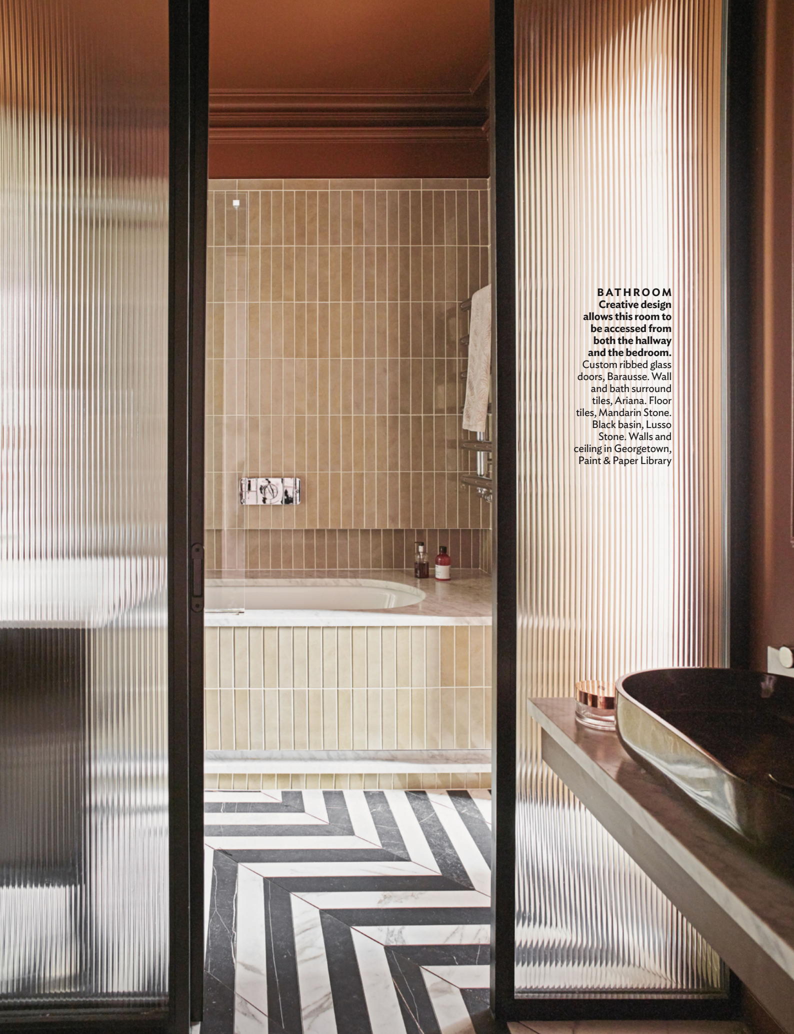
BATHROOM Creative design allows this room to be accessed from both the hallway and the bedroom. Custom ribbed glass doors, Barausse. Wall and bath surround tiles, Ariana. Floor tiles, Mandarin Stone. Black basin, Lusso Stone. Walls and ceiling in Georgetown, Paint & Paper Library